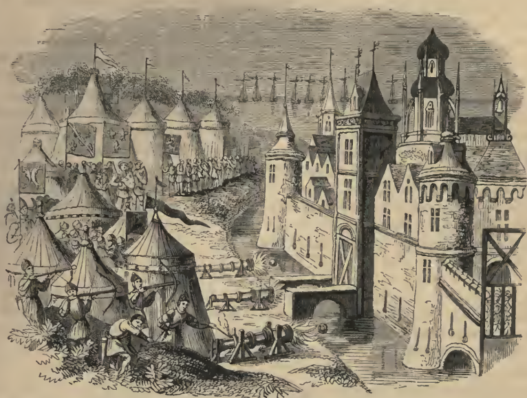
SIEGE OF THE TOWN OF AFRICA. From a MS. Froissart of the 15th century.

who had been there, that had the lord de Coucy been commander-in-chief, instead of the duke of Bourbon, the success would have been very different ; for many attacks on the town of Africa were frustrated by the pride and fault of the duke of Bourbon : several thought it would have been taken, if it had not been for him.